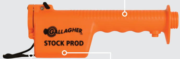
Safety wrist strap